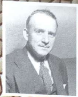
John P. Humphrey (Canada)