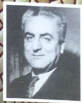
Dr. Charles Malik (Lebanon)