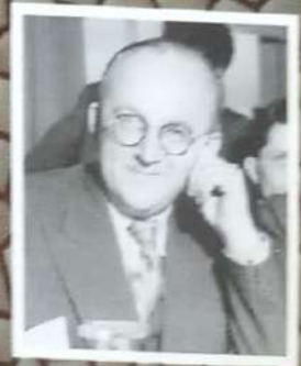
Charles Dukes (United Kingdom)