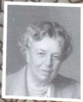
Eleanor Roosevelt (US)