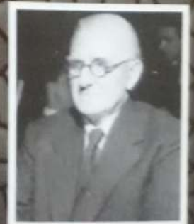
Alexabdre Bogomolov (USSR)