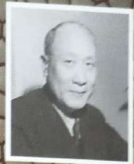
Dr. Peng-Chun Chang (China)