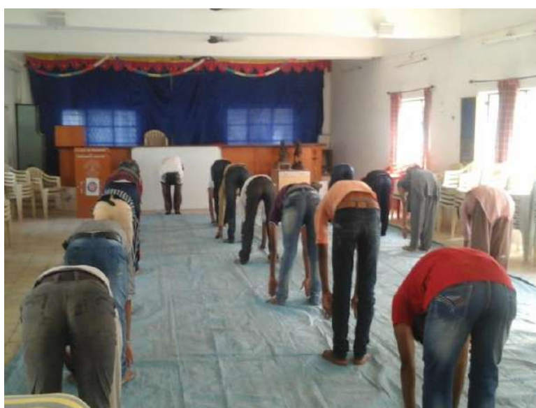
LT. B. M. MANF ANO S S C. College Junnar